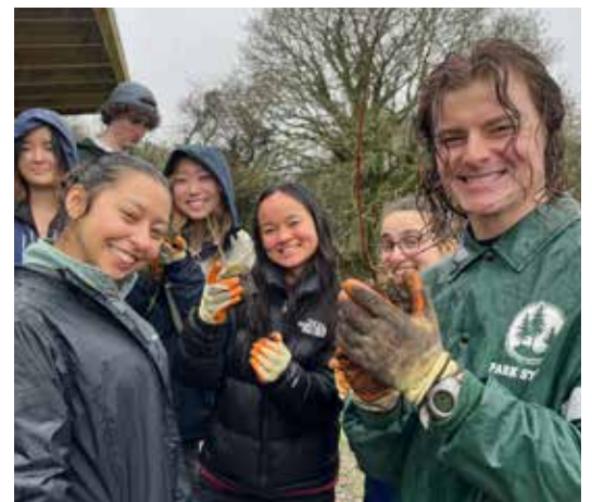
RIGHT: CASA students 2024, Home Tree site visit