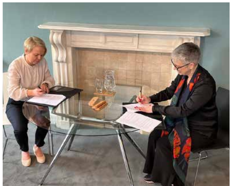
RIGHT: Signing of MOU with the University of Bergen.