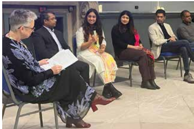
ABOVE: Diwali Event.

Trinity Centre for Literary Translation hosted an event with Booker Prize nominee and Trinity graduate Sebastian Barry and translators of his work in the Long Room Hub in September.