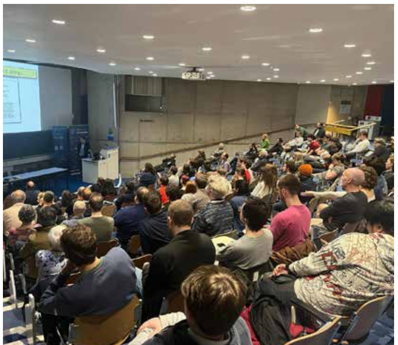
RIGHT: The second annual 'Łukasiewicz Lecture' in collaboration with the Polish Embassy and the School of Mathematics.