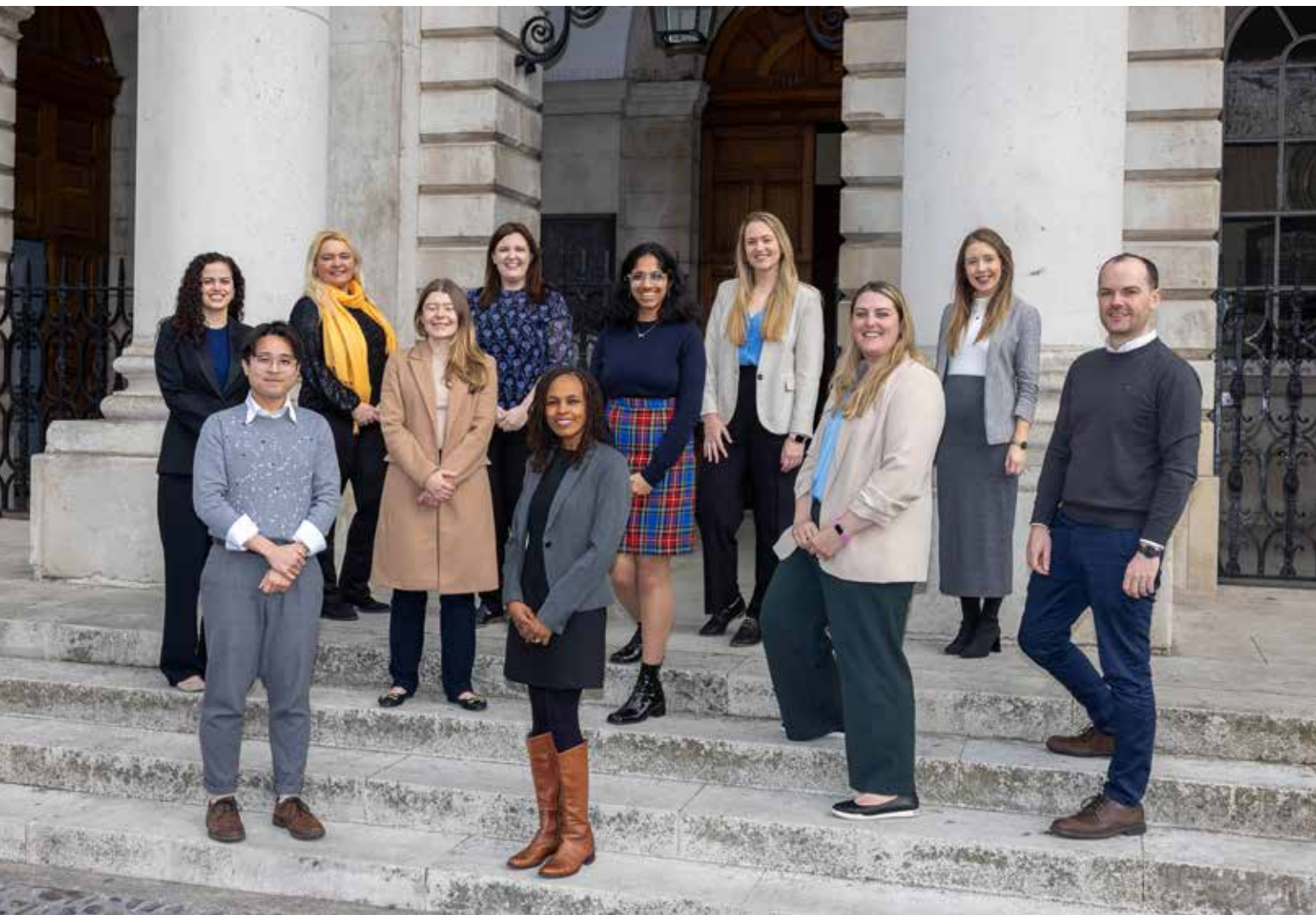
BELOW: Restructured Partnerships and Global Mobility team.