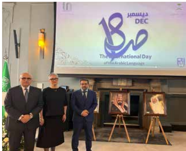
ABOVE: International day of Arabic Language.