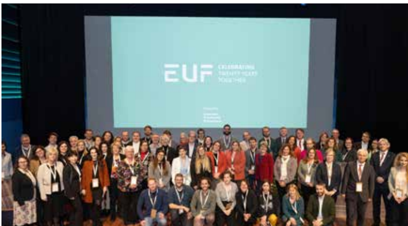
ABOVE : EUF 20th Anniversary

Trinity Global attended the 20-year anniversary celebration of the European University Foundation (EUF) along with more than 80 members. The team also engaged with the EUF on Erasmus specific training.