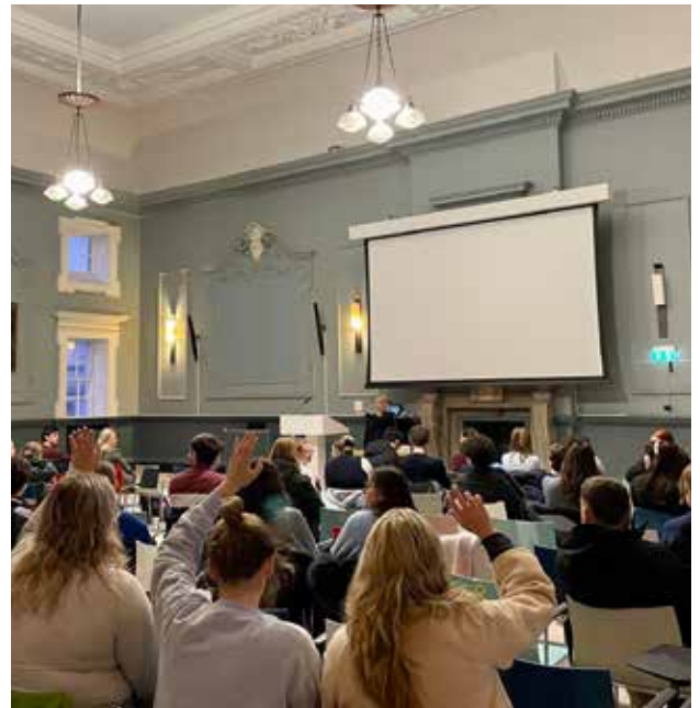
ABOVE: Returning exchange student event.

“While the Global team and I were in Boston and Washington DC with Simon Harris on his ministerial visit, the team worked tirelessly to ensure we made the most of our time, strengthening our undergraduate mobility partnerships at Harvard and other universities and supporting me in forging a new research collaboration with Boston College.”