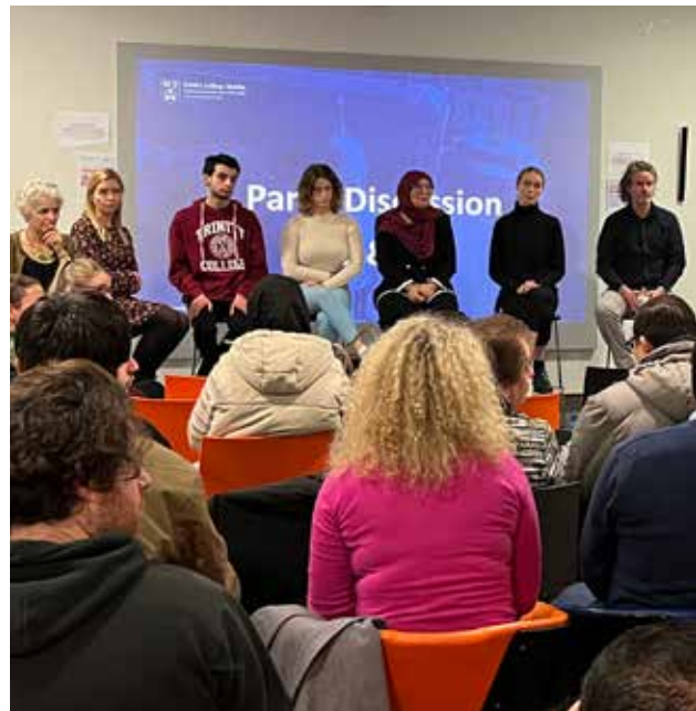
ABOVE: Day of Refugee Solidarity Event.

Trinity launched the University of Sanctuary Steering Group and Fund Advisory Committee to oversee Trinity's University of Sanctuary initiatives. We also appointed a University of Sanctuary Support Officer to support students through their journey at Trinity.